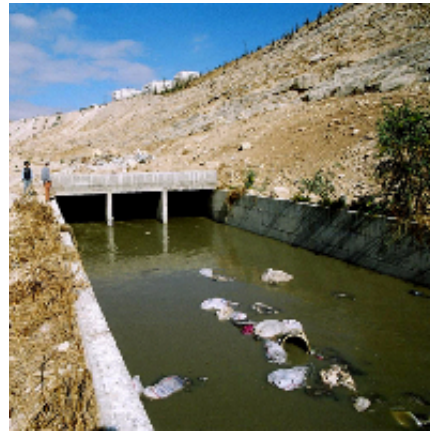
Solid Waste in the Kidron River

Through SIPP, members of our community are working on a project to assist local Israelis and Palestinians in a joint effort to clean up their shared environment. By contributing to this effort, you can help develop trust and respect among people whose conflict has led to distrust and fear. In this way you will be a part of a local approach to peace-making in the Israeli/ Palestinian conflict.