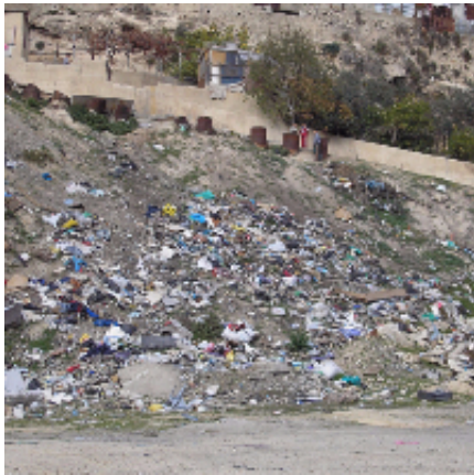
Garbage dumped in the Kidron Valley

Sustainable Israeli-Palestinian Projects is a nonprofit 501(c)(3) tax exempt corporation.